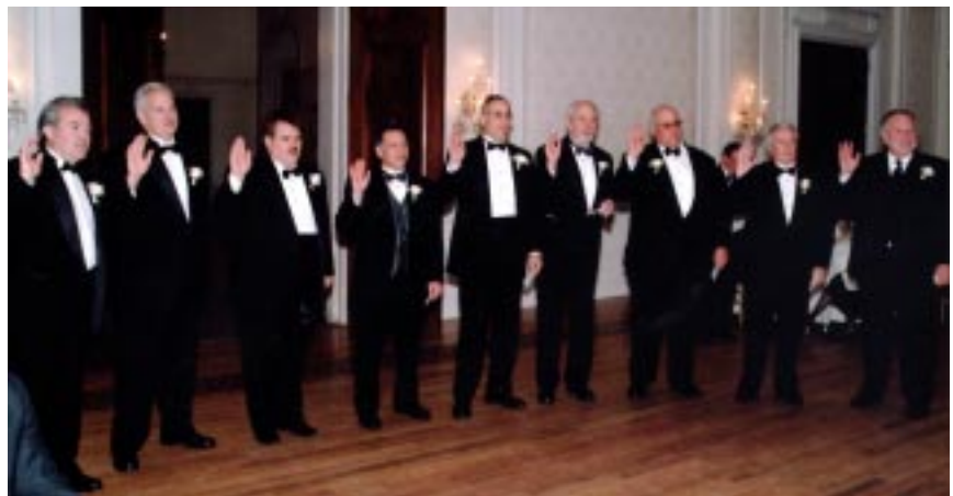
Officers and Directors take the oath of office at the Long Island Chapter Installation Dinner on January 7th at OHEKA Castle. —See page 3